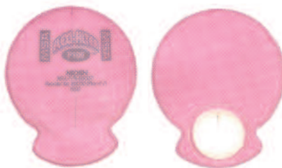
MIS-500B (Front, Back)